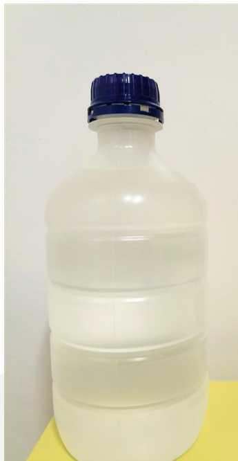
Irrigation bottle and cap