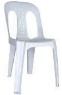
Plastic resins made from discarded plastics