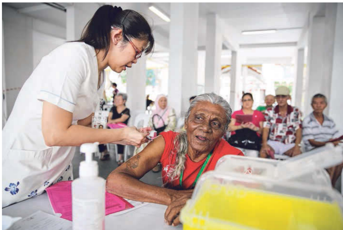
A vaccination session by Tan Tock Seng Hospital in 2015. The flu jab study, by the National Centre for Infectious Diseases and Tan Tock Seng Hospital, had 200 participants aged 65 and up. Its findings could help determine how often people here should get a flu jab.

Researchers found getting vaccinated twice a year may better protect elderly S'poreans