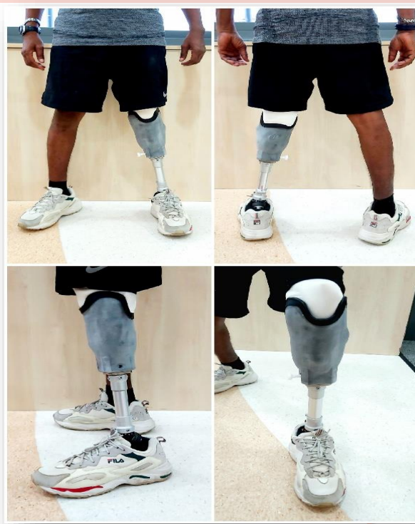
Research subject receiving his prosthesis fitted with 3D printed sockets

Patients also appreciated the better accuracy of fit of the 3D printed sockets. Our P&Os and technicians benefitted from time savings to produce a good fitting 3D printed socket as compared to the laminated ones. This method of 3D scanning and printing shows promise in delivering better care to amputee patients within NHG.