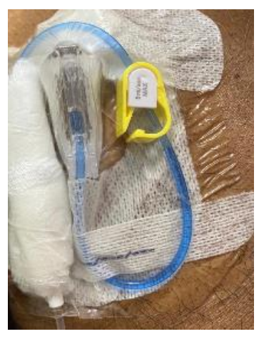
Example of a Port-A-Cath