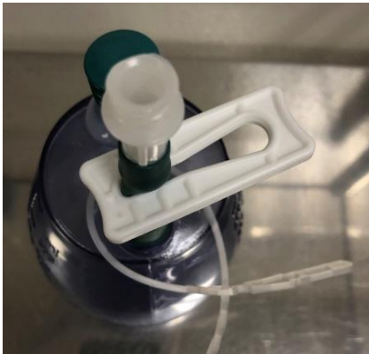
Wrong: Drain is Clamped