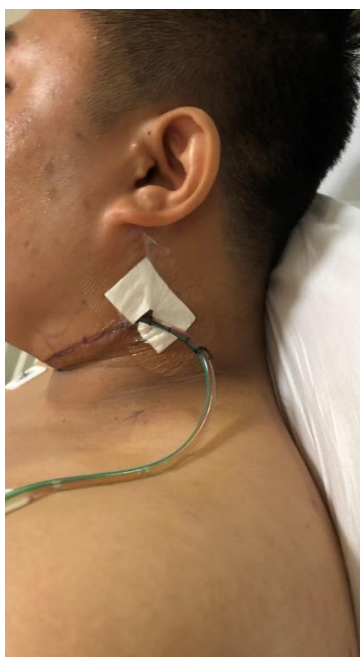
a. Taping the drain to the neck

2. Refer to the pictures below on how to position and carry your drain: