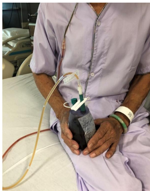
b. Carrying the drain with you