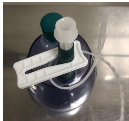
Correct: Drain is Not Clamped