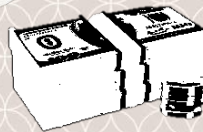
Cash/ credit card