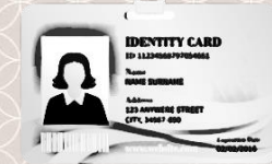
Identification card/ documents*

In the event that you need to leave the house, you may want to have the following in your emergency bag: