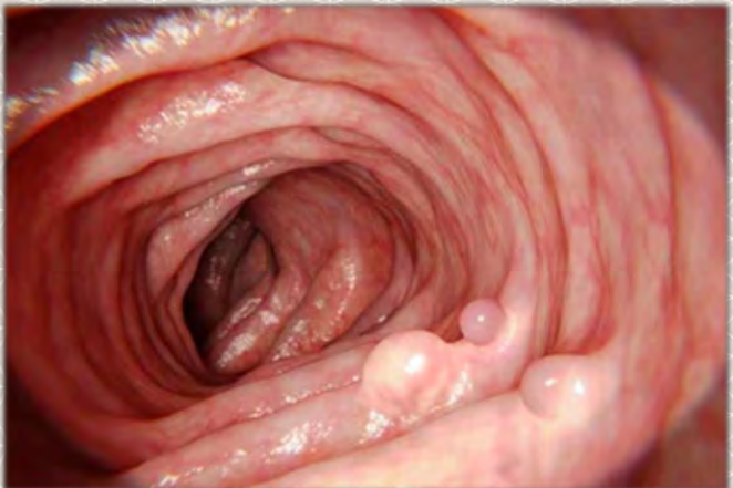
Inside of large intestine using colonoscopy