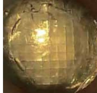
Femtosecond laser lens fragmentation.