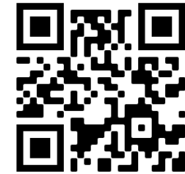
How to Use Metered Dose Inhaler (MDI) with Spacer

Scan the QR Codes above with your smart phone to access the videos on our TTSH YouTube Channel.