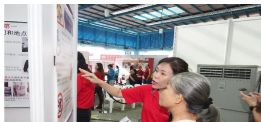
Educating a participant on falls prevention

A total of 810 elderly participants took part in this event.