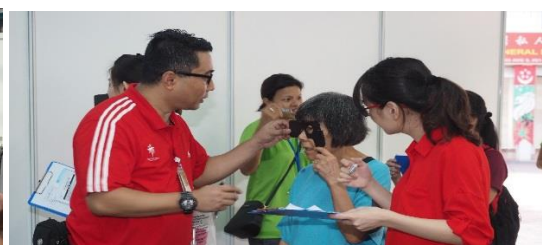
TTSH nurse conducting eye screening for participants