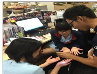
Volunteer Ambassadors reaching out to staff, patients & visitors.

The aim of this campaign is to raise the awareness on the importance for proper hand hygiene in preventing the spread of infection.