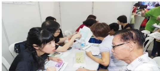
Participants getting advices

The event held at Ang Mo Kio Central Stage on 16 Jul 2016 was targeted at older adults aged 60 and above, with the objectives of raising awareness and prevention of fall risks in the community.