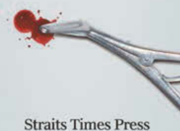
Grab a copy at major bookstores and