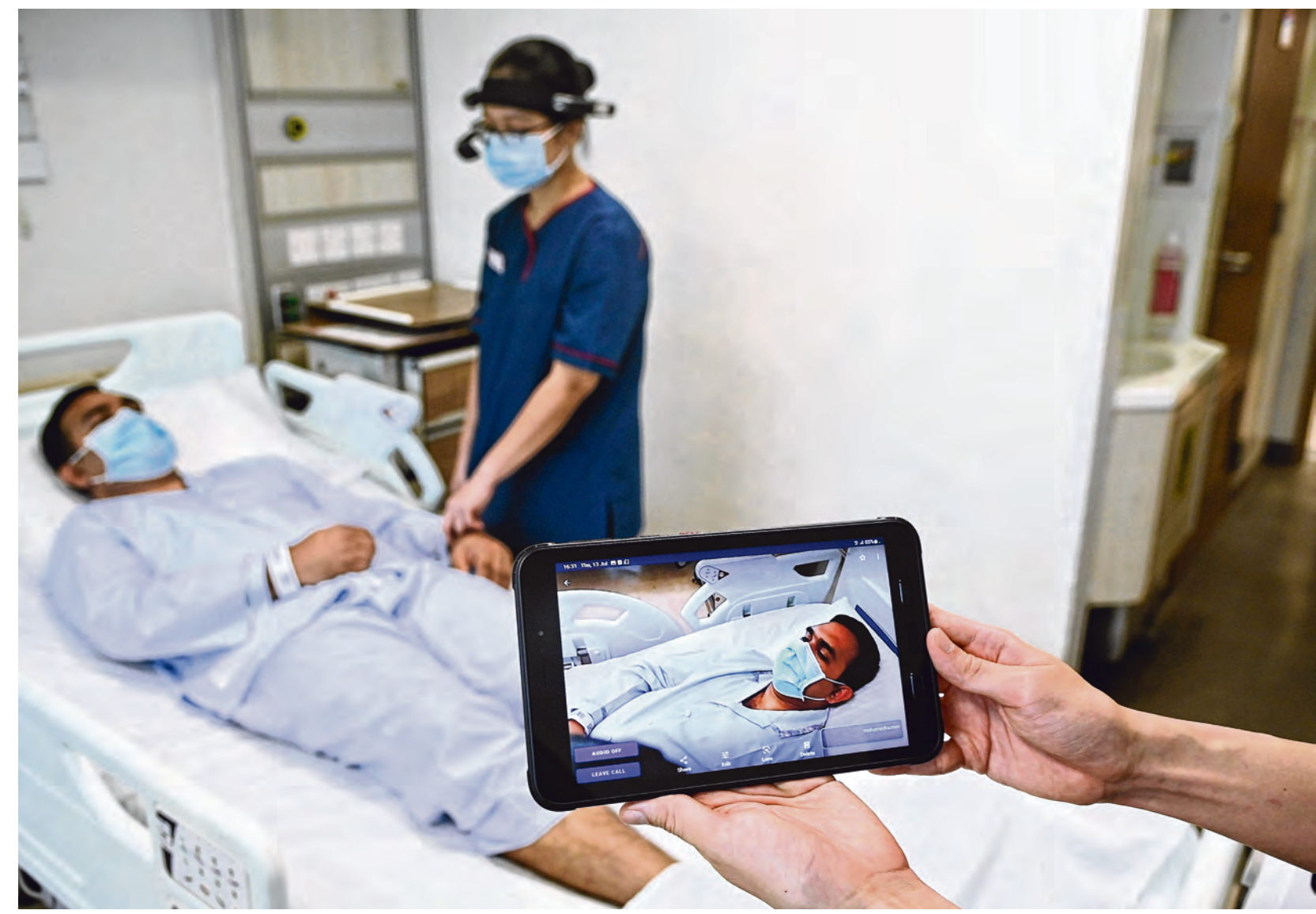
The smart ward team at Tan Tock Seng Hospital leverages digitalisation, robotics and artificial intelligence to change the way its staff work and care for elderly patients. Gadgets and automated equipment improve services and lighten the staff's load.