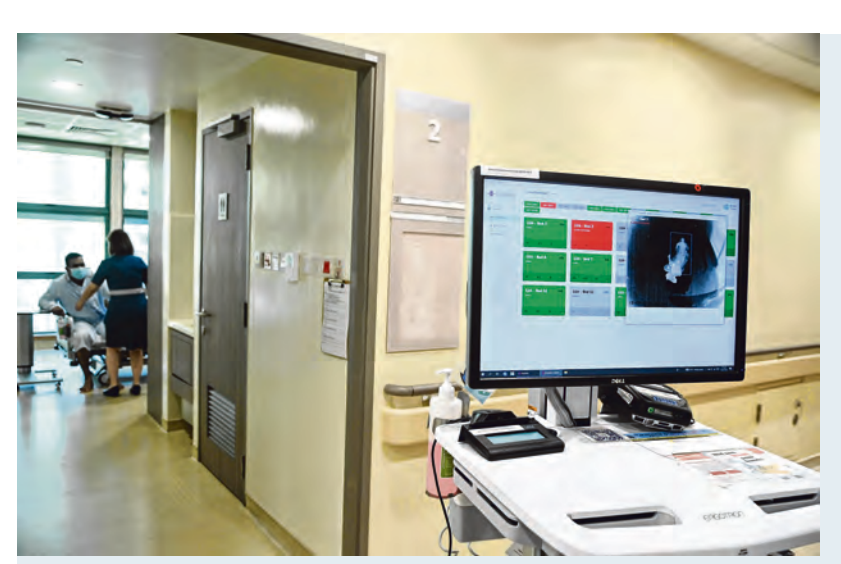
The smart predictive patient monitoring system at TTSH uses thermography, machine learning and predictive algorithms to predict when a patient is getting out of bed, giving nurses time to intervene.