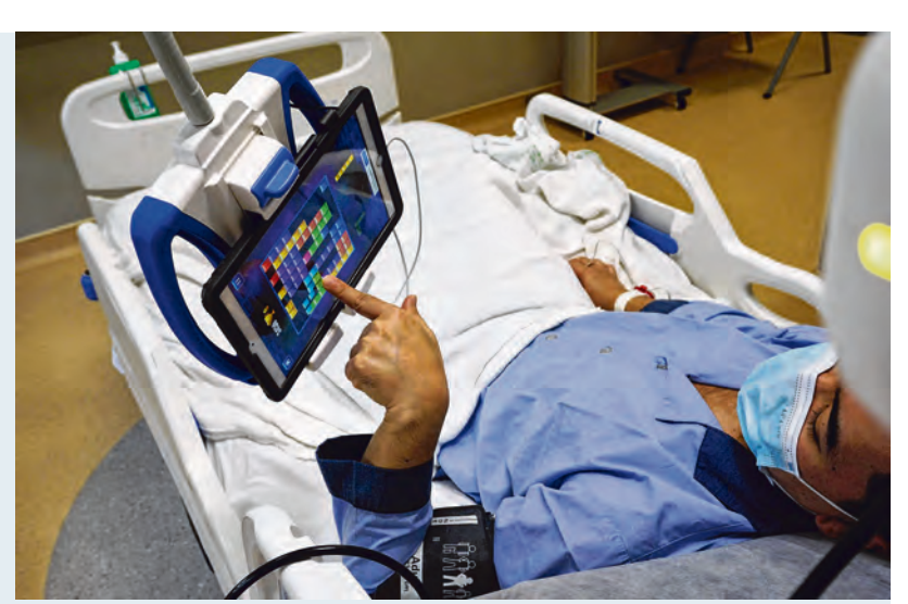
A bedside tablet gives patients real-time information of their care schedule, medical data, and educational materials. They can also play games that promote cognitive engagement and facilitate rehabilitation.