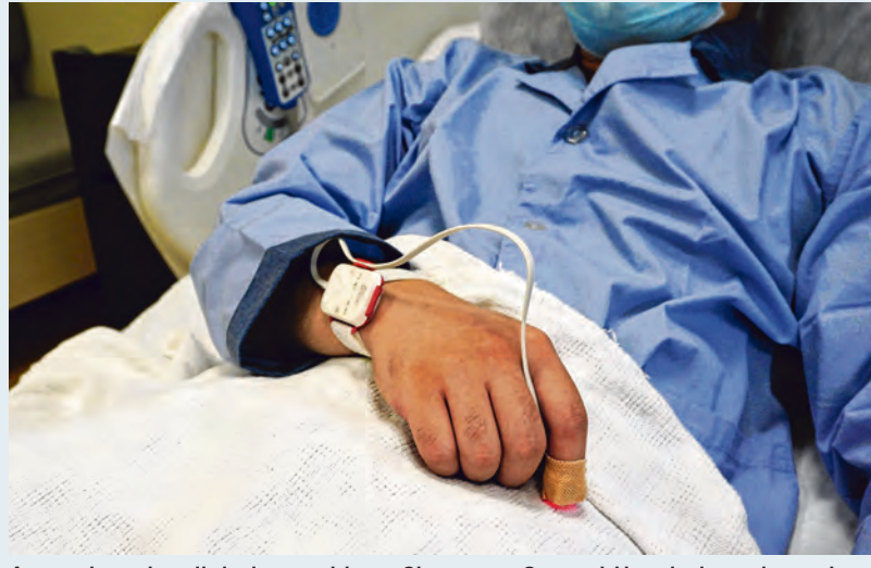
An unobtrusive digital wearable at Singapore General Hospital monitors the vital signs of patients minute-by-minute without disrupting their rest, while also relieving nurses of the task.

In the smart wards in SGH, patients can put on digital wearables if their vital signs need to be monitored more frequently. These medical-grade wearables automate the reading of these signs minute-by-minute, relieving nurses of the task while enhancing patient safety and rest. Judith Tan