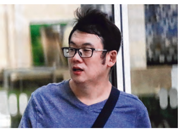
At the courts • Jail for drunk passenger who attacked cabby and cop | A21