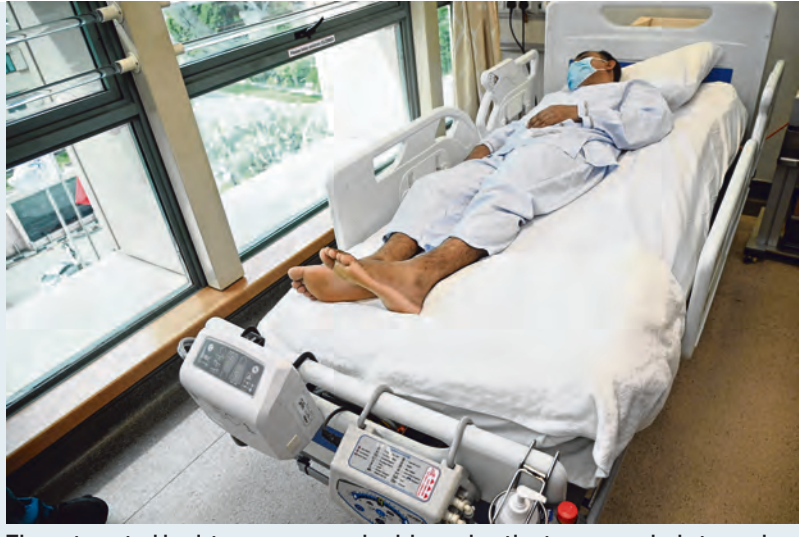
The automated bed-turner ensures bed-bound patients are regularly turned, so they do not develop pressure injuries. It also helps reduce the potential for staff injury as the job requires a lot of effort and strength.