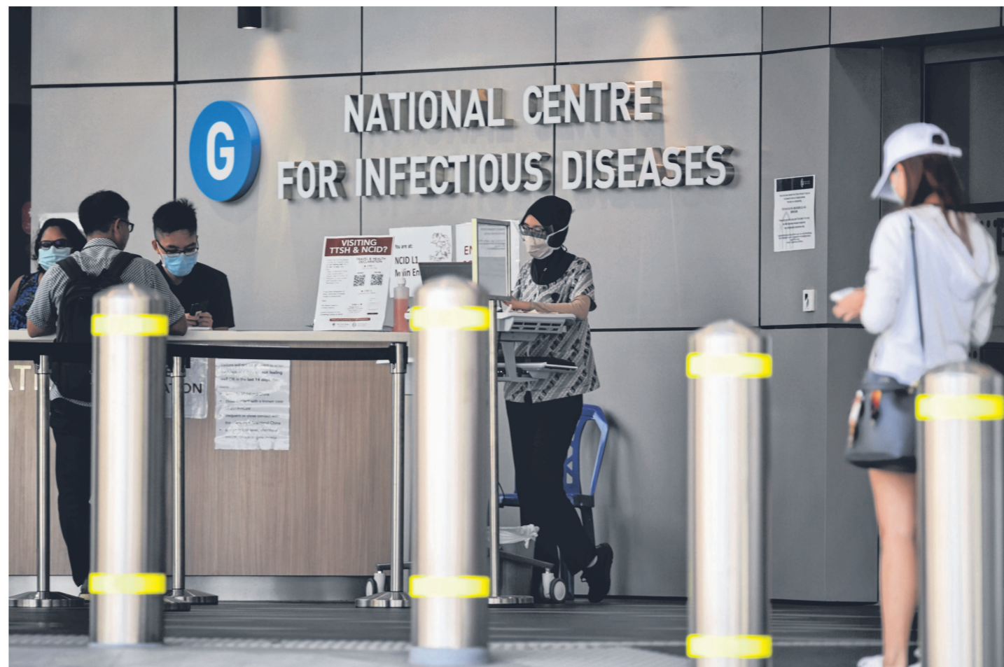
In Singapore, doctors monitor viral shedding in a patient's respiratory tract – in other words, they check if the patient is still releasing live virus and thus remains contagious. Virus shedding stops when the patient no longer has the virus in him.

rector of NCID, said doctors here monitor viral shedding in a patient's respiratory tract – in other words, they check if the patient is still releasing live virus and thus remains contagious. This is done by taking nasal or throat swabs or sputum.