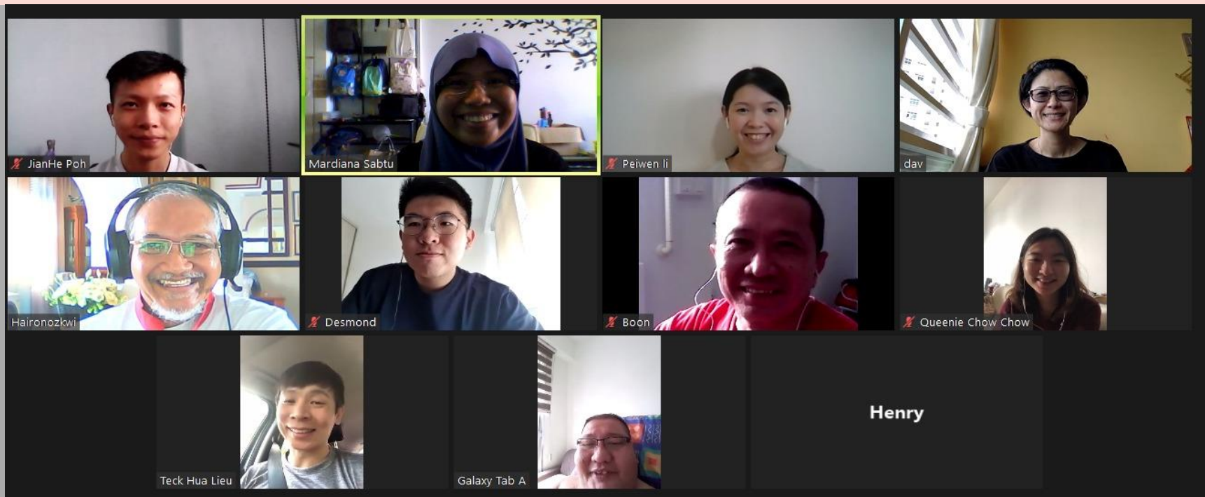
Mid-year check in session with befrienders in July 2020 and training about tele-befriending via Zoom.

This project strives to enhance social integration and reintegration in the community for persons with amputations (PWAs) via peer-befriending and personal empowerment. Identified befrienders are our former patients with amputation who are well-integrated in the community. The befrienders serve as peers, coaches and facilitators to encourage patient activation, with support and oversight provided by Allied Health professionals from Tan Tock Seng Hospital and Ang Mo Kio-Thye Hua Kwan Community Hospital.