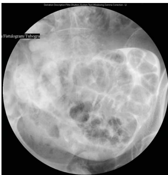
Fig. 1. Anterior-posterior view of sinogram revealing free contrast in the peritoneal cavity lining the visceral surface of the small bowel loops.

Recognising the inappropriately low fluid creatinine level, a sinogram was performed. This revealed a peritoneo-cutaneous fistula with free flow of contrast into the hernia sac (Figs. 1 and 2). We counselled her on the finding and possibility of peritonitis. Unfortunately, she refused an incisional hernia repair and closure of fistula tract. To our