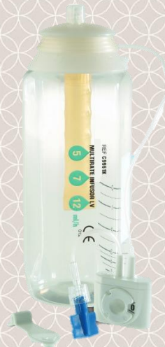
Image of balloon infuser with rate adjuster