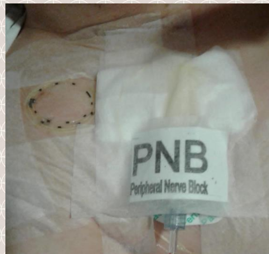
Image of a Peripheral Nerve Block catheter insertion site