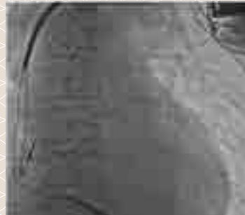
X-ray guided implantation of the ICD leads

After the injection of anaesthetics, a small incision or cut is made in the upper chest to create a small "pocket" under the skin to accommodate the pulse generator. One end of the pacemaker wire is connected to the pulse generator while the electrode end of the wire is inserted through a vein in the upper chest and is positioned in the heart with X-ray guidance.