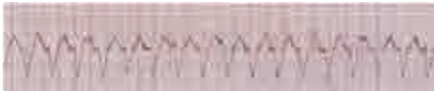
Fatal Heart Rhythm