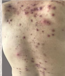
Acne-like rash.