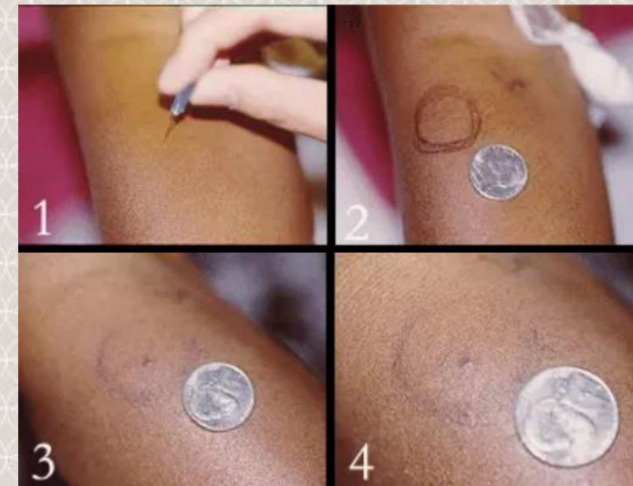
Example of a positive pathergy test.