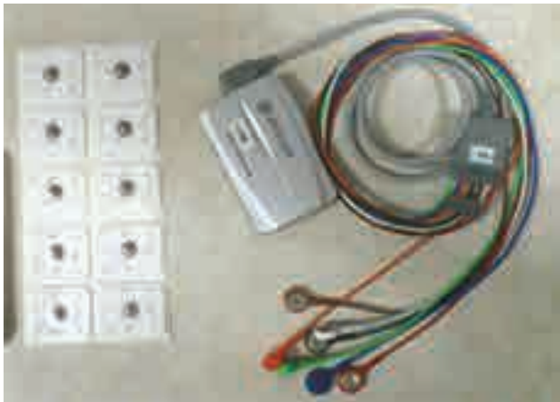
Monitoring equipment to be used includes electrodes, a small monitor device and cables.

Prolonged monitoring is ideal for detecting intermittent heart rhythm abnormalities. Specifically, it studies the impact of different activities at various times of the day on the heart rhythm or simply obtaining more detailed information about the heart's behaviour.