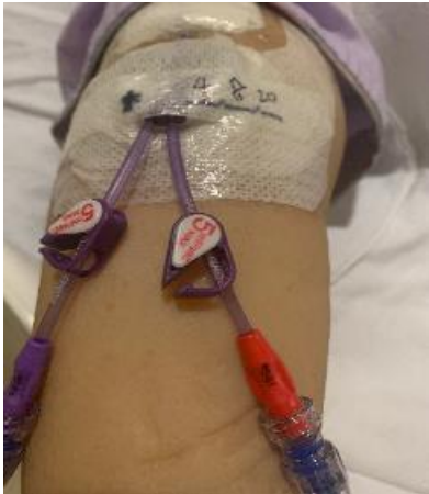
Example of a Peripheral Inserted Central Catheter (PICC)

The LV infusor is connected to a vascular access device such as the Peripheral Inserted Central Catheter (PICC) or Port-A-Cath.