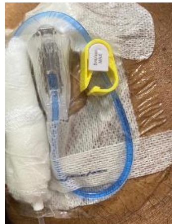
Example of a Port-A-Cath