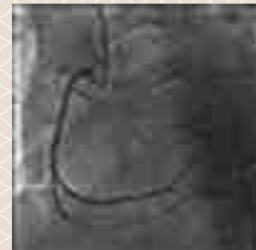
Right coronary artery