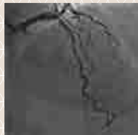
Left coronary artery