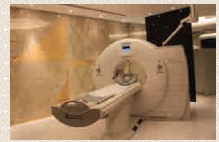
Cardiac CT Imaging Machine

When the above tests are done, a small plastic tube or cannula is inserted into one of the veins on your arm for the injection of the contrast material. The procedure takes place in the Cardiac CT Laboratory.