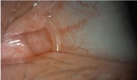
Image of a stent at inner corner of the eye.

When you awake from the general anaesthetic, you may have a nose-pack in the affected nostril. There is usually no pain even when you wake up. An ice-pack would be placed on the eye of the operated side. A silicone stent would have been placed in the corner of the eye on the operated side.