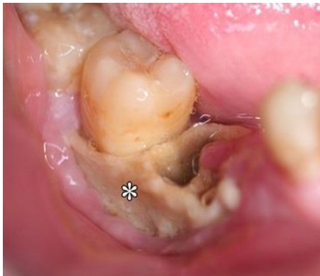
Dead, exposed bone