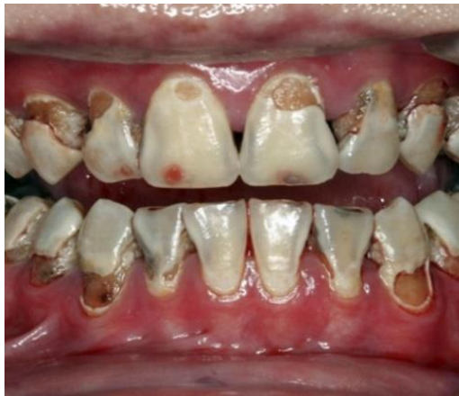
Rapid tooth decay