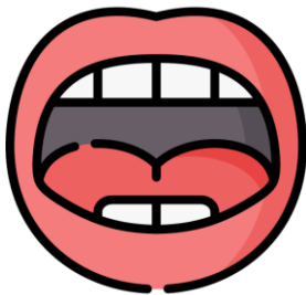
Skin lining of the mouth