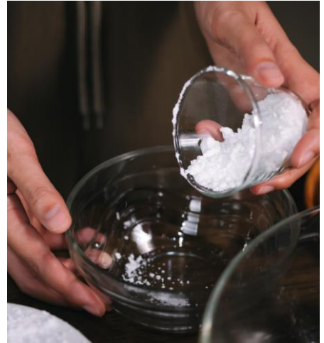
Use of baking soda to make the mouthwash