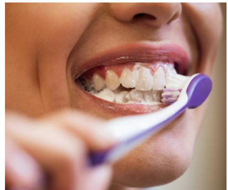
Brush your teeth after every meal