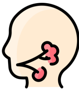
Salivary glands (Organs which make saliva)