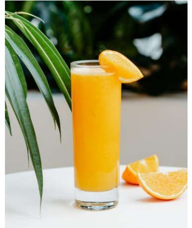
Fruit juice with hidden sugar