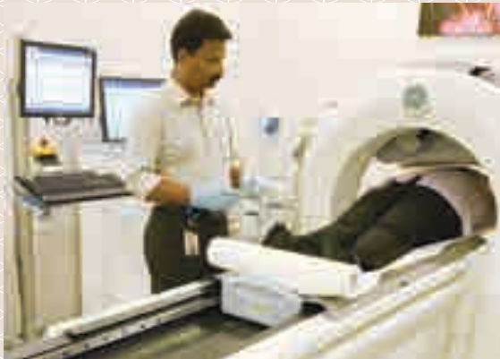
Imaging table and the gamma camera used to capture images of the heart.

The exercise stress myocardial perfusion imaging test assesses the blood flow to the heart muscle when the heart is made to work harder ('stressed'). This test determines the likelihood of a blockage in one or more of the coronary arteries. Blood flow in the heart is assessed by injecting a very small amount of a radioactive chemical, usually technetium or thallium, which is absorbed by the heart. The heart is then imaged using a special gamma camera.