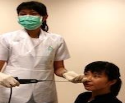
Flexible scope placed in your nose and throat during FEES