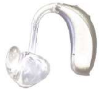
Fig 2. BTE hearing aid turned on