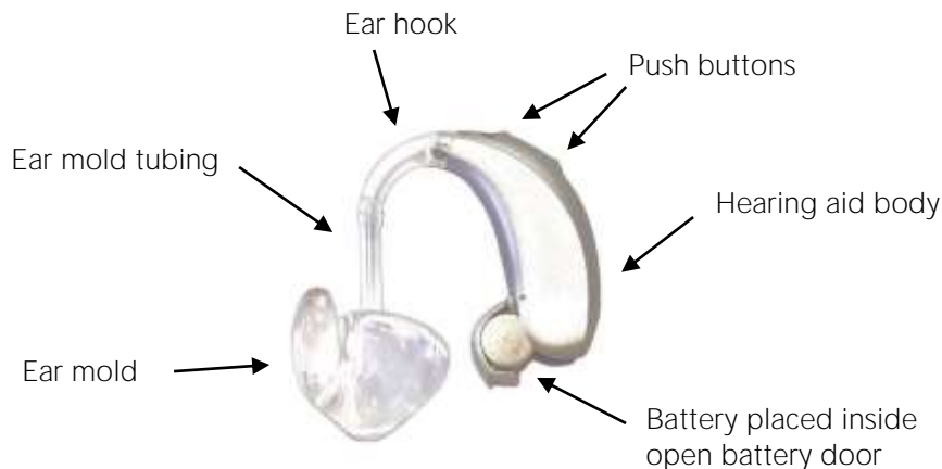
Fig 1. BTE hearing aid turned off