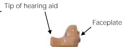
Fig 6. Top view of In-the-Canal hearing aid