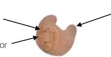
Fig 5. In-the-Ear hearing aid