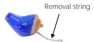
Fig 7. Completely-in-Canal hearing aid