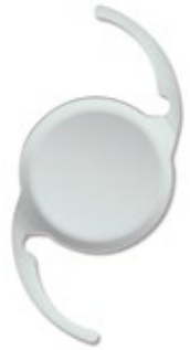
Monofocal intraocular lens.

These are the most commonly implanted lenses, which are designed to achieve good vision for a single, specific distance (focal point). It is usually set for distance vision, although it can be set for near or intermediate vision. When set for distance vision, glasses are usually not required. However, reading glasses will be required for near and intermediate vision. Nevertheless, quality of vision is excellent for both distance and near with reading glasses.