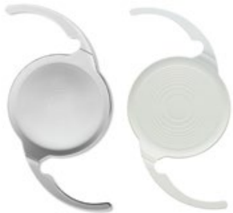
Multifocal intraocular lenses.

Multifocal lenses provide the opportunity to be less dependent on glasses for distance, near and intermediate vision. These lenses work by projecting light into the eye from two or three focal points. Hence, a person is able to have good vision for both near and far objects.