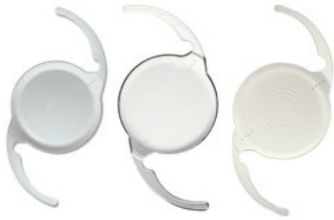
Toric intraocular lenses.

Astigmatism or 散光 (sǎn guāng) can be corrected with a toric lens. Reducing the amount of astigmatism reduces your dependence on glasses. The properties of a toric lens can be incorporated into monofocal, multifocal and enhanced depth of vision lenses. It is also essential to reduce astigmatism for multifocal or enhanced depth of vision lenses to allow them to function properly.