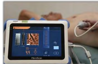
Example of fibroscan (Obtained from Dove Press Medical Limited)