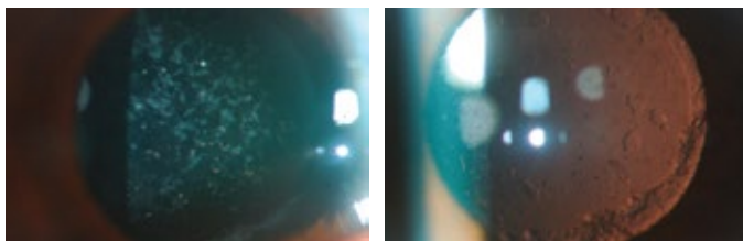
Image of the different appearances of the thickened posterior capsule post cataract surgery.

Nd:YAG laser capsulotomy involves directing a laser beam to the thickened capsule. This creates a small opening in the center of the capsule, allowing light to pass through once again.