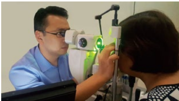
Image showing a patient undergoing the laser procedure.