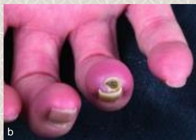
(a) severe skin tightening of fingers resulting in contractures; (b) fingertip ulcer.