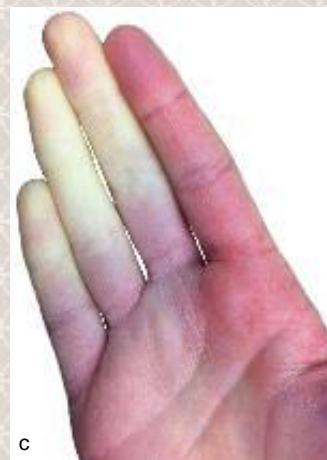
(c) Raynaud's phenomenon.